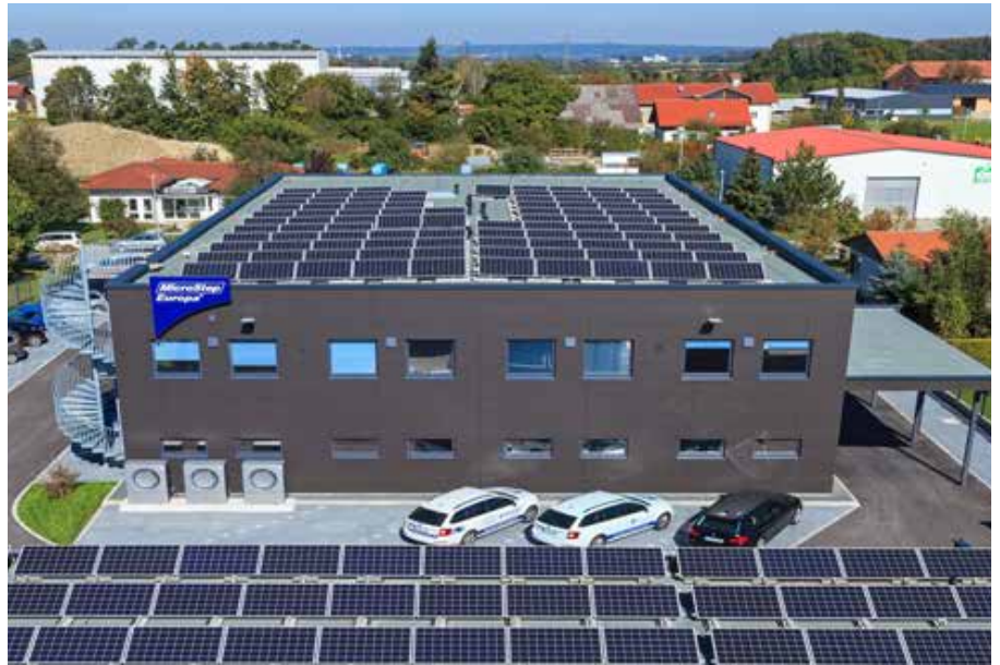
MicroStep Europa® GmbH new office in Bad Wörishofen, Germany – rear view

MicroStep decided to build their new office in Bad Wörishofen. The most important investor requirement was: maximum savings using renewable energy and maximum efficiency in heating and cooling the building. When choosing materials for the build the aim was to reduce heat loss as much as possible. It was clearly stated from the beginning that the heat source must be in accordance with the quality of the materials used for construction, moreover the heating system supplier must have extensive experience in