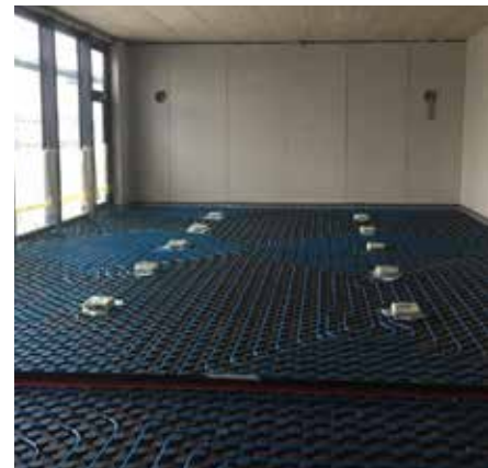
Floor heating (indoor)

Activated Building Structures (TABS). These systems integrate the indoor climate management into the fabric of the building, minimizing the need for conventional technologies. When the foundations were finished then work proceeded with a focus on high-quality insulation. Using a modular solution, the heating distribution system was divided into several heating circuits. The major benefit is being able to independently control individual zones of the building. A Thermia Atec air source heat pump with indoor control system was installed in the technical room. All the heat pumps can be remotely controlled by a user-friendly interface.