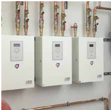
Atec control system (indoor)