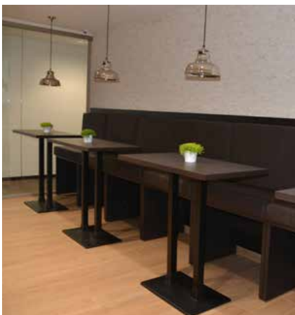
Foyer at conference rooms