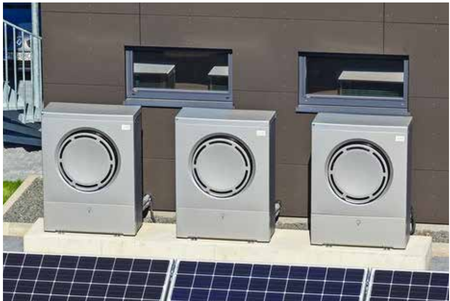
Thermia Atec air source heat pumps (outdoor)

In the foundations of the construction, Pex pipes for heating or cooling were installed – known as, Thermally